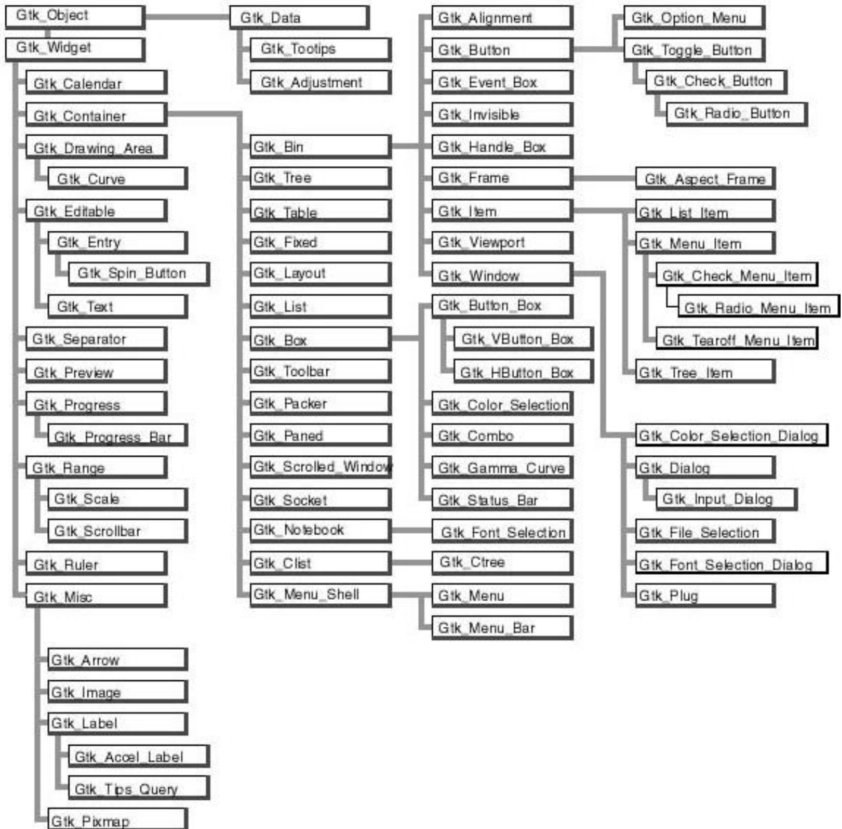
Fig. 1: Widgets Hierarchy